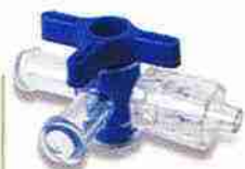
4 way (360°)