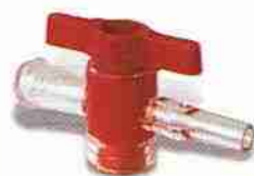
1 way (90°/360°)

Elcam also offers stopcocks suitable for gamma radiation and stopcocks for lipid solutions.