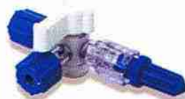
3 way (180°)